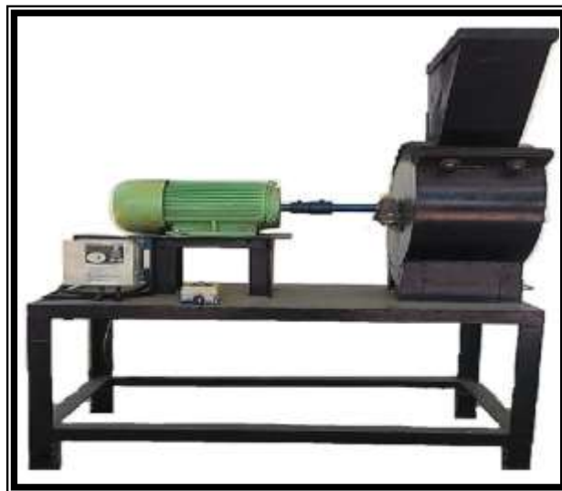
Figure 2. The final set-up of the machine.