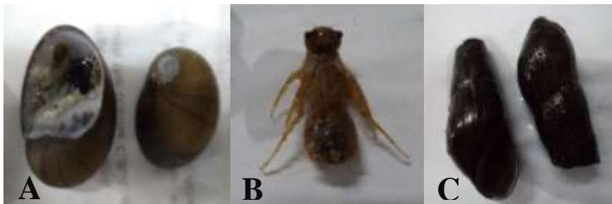
Figure 3. The top three most abundant macrobentos taxa in Donata Falls. A) Nerita sp.; B) Coenagrionidae larvae; C) Melanoides sp.

The results of the study are similar to the findings of the study by Flores and Zafaralla (2012) wherein the Mananga River in Cebu, Philippines was also found to be dominated by gastropod Nerita and Melanoides . Likewise, similar are the results of the study by Dacayana et al. (2013), where they assessed the benthic macroinvertebrate assemblage in Bulod River in Lanao del Norte, Philippines to evaluate its water quality. Bulod river was dominated by insect larvae Coenagrionidae and mollusks such as Nerita , Melanoides , and clams and mussels. The water quality of the river turned out to be good based on the abundance of these indicator species and the calculated FBI values of 3.94 to 3.96.