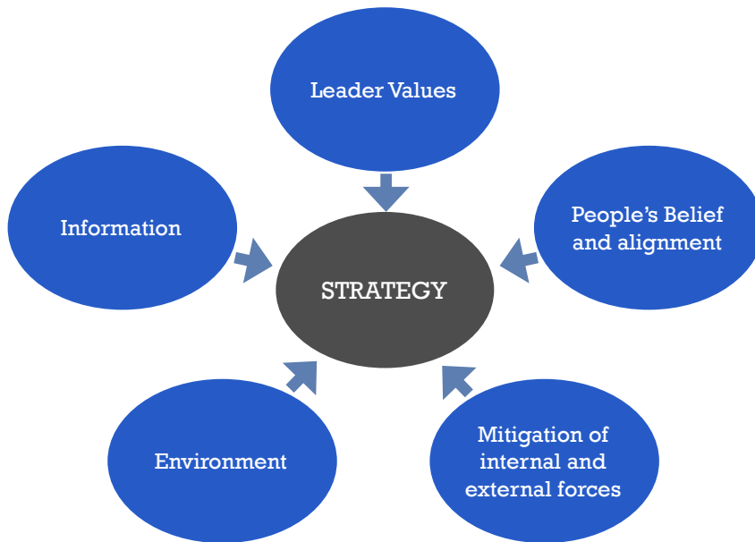
Figure 1: Relational Elements Modern Strategy.

While this synthesis compresses some nuances, it provides a coherent relational framework that preserves the spirit of Sun-Tzu’s philosophy while making it applicable to modern conflicts. This combined approach ensures that the analysis is both grounded in contemporary evidence and faithful to the philosophical roots of Sun-Tzu’s strategic thought.